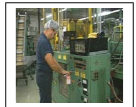
Verify Machine is in Safe Condition

Through OSHA's Alliance Program, this Safety Alert was developed as a product of the Alliances OSHA has signed with the American Industrial Hygiene Association , the American Society of Safety Engineers , the American Shipbuilding Association , the National Shipbuilding Research Program , and the Shipbuilders Council of America . It is for informational purposes only and does not necessarily reflect the official views of OSHA or the U.S. Department of Labor.