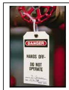
Lock and/or Tag all Sources