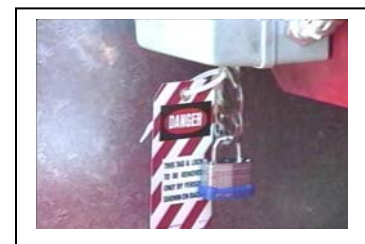
Locked and Tagged Out